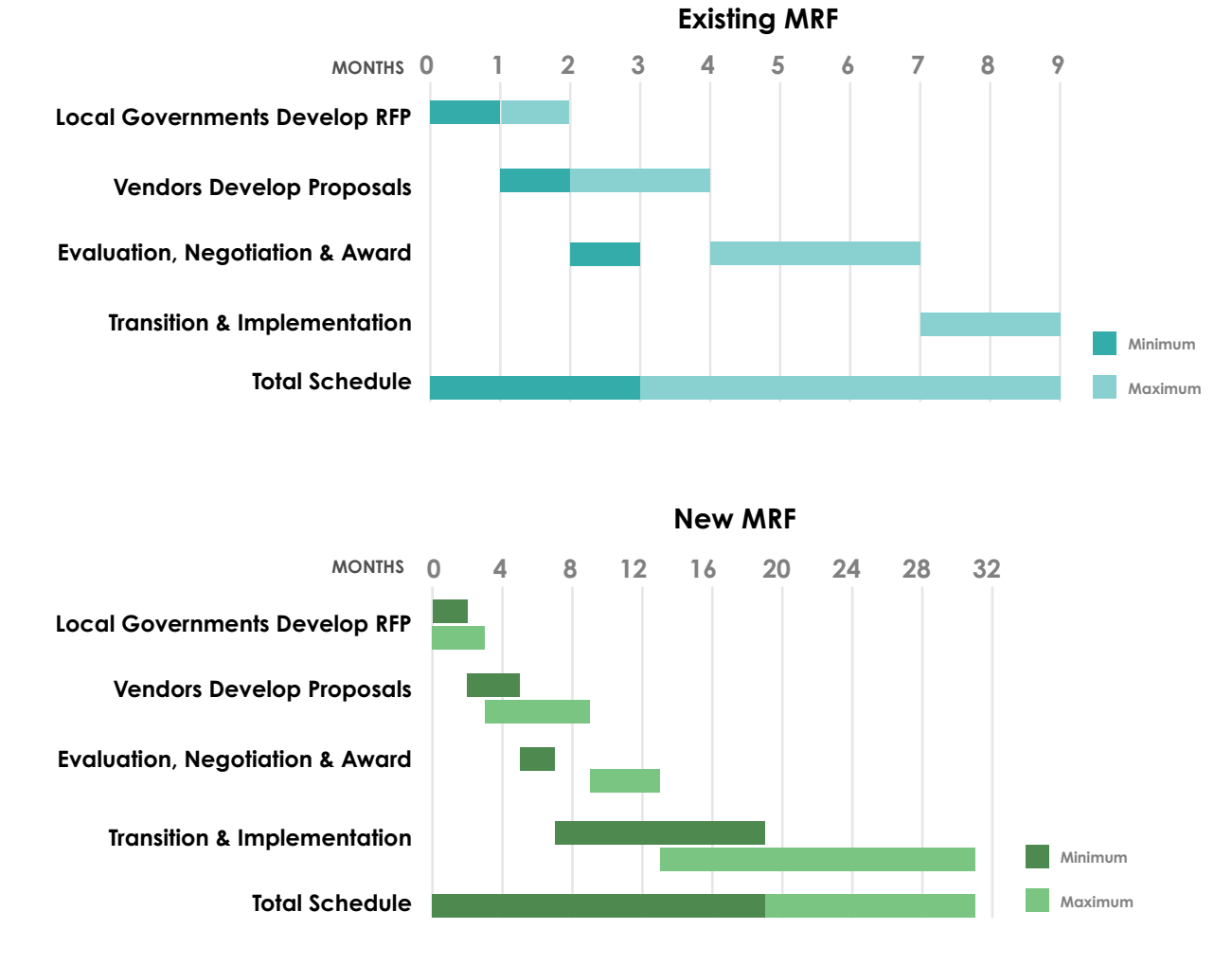
Figure 7: Recommended Schedule for Recycling Processing Procurements

A key factor in determining how much time is needed for the procurement process depends on the competitiveness of the local recycling processing market and processing capacity in that region. For example, if there are multiple MRFs in a region with extra processing capacity, the procurement process will require less time since a range of possible suitable MRFs are already in place. On the other hand, if there is a need to build a new MRF based on the outcome of the procurement process, much more time would be required to allow the recycler to design, build, and start operating a new facility, or potentially build a transfer station to transport the material to a MRF. Longer MRF contracts may also be appropriate when a community is trying to attract a new facility. Aligning with the key steps for an RFP process in Figure 6 and Figure 7 provides perspective on recommended schedules based on whether a local government would expect to enter into a contract with an existing and/or new MRF and based on what type of contractual agreement a community chooses.